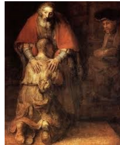
The Prodigal Son